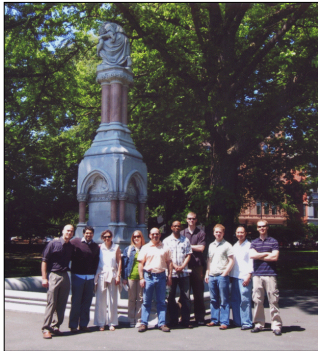
Ether Monument in Boston Public Gardens