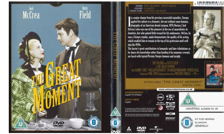
The Great Moment, a 1944 Hollywood movie