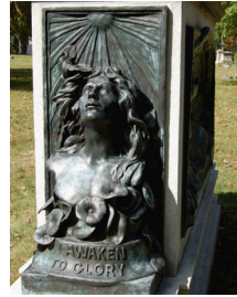
Horace Wells' Grave (l), Cedar Hill Cemetery, and Statue (r), Bushnell Park, Hartford, CT