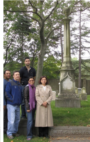
WTG Morton's Grave, Mt. Auburn Cemetery, Cambridge, MA