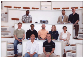
Ether Dome at Massachusetts General Hospital, Boston