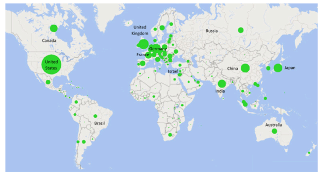
Figure 2: Global Distribution of Clinical Trials Pre-Coronavirus