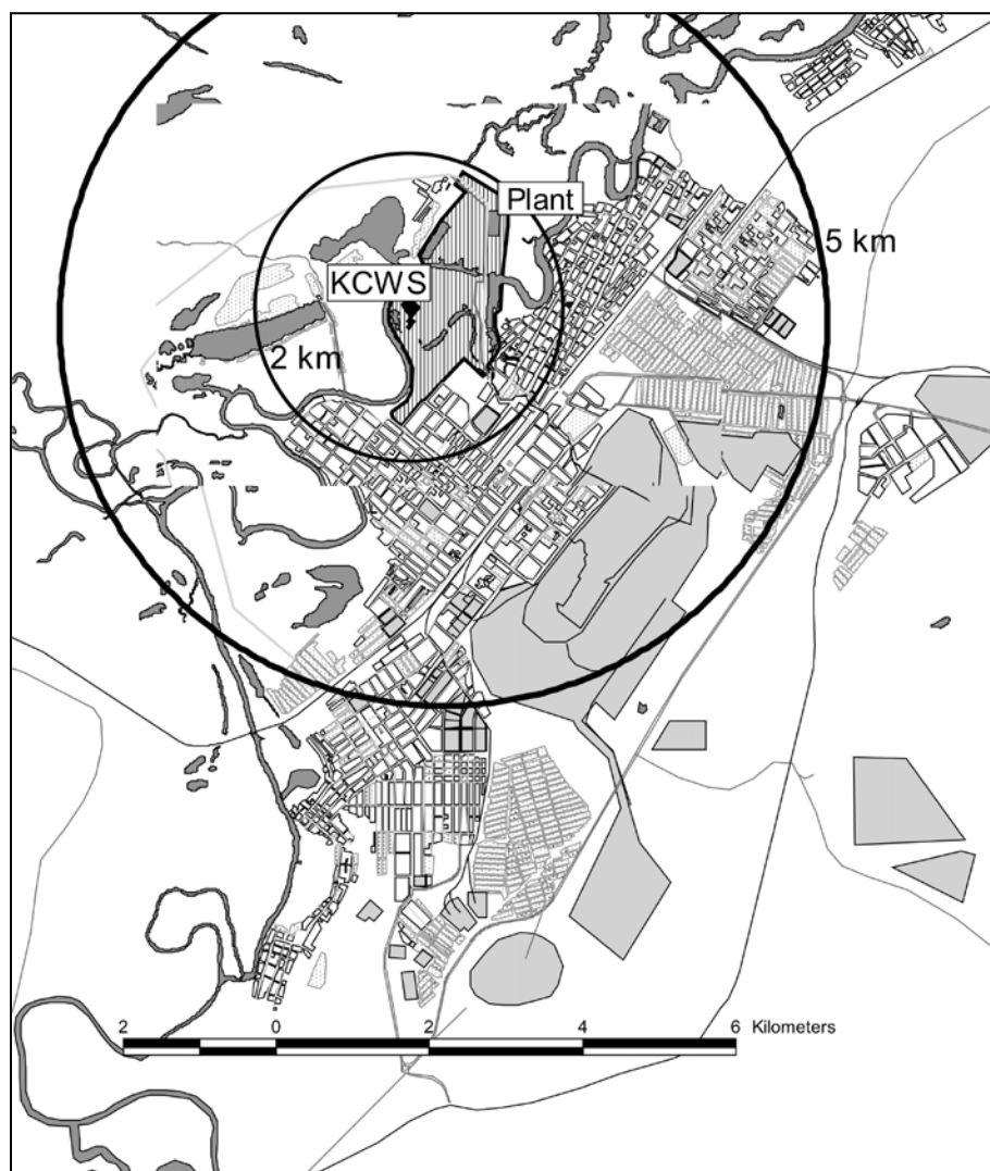
Figure 1. Map of Chapaevsk, location of Khimprom (plant), Khimprom chemical workshop (KCWS).

Dietary information. A validated Russian Institute of Nutrition (RIN) semiquantitative