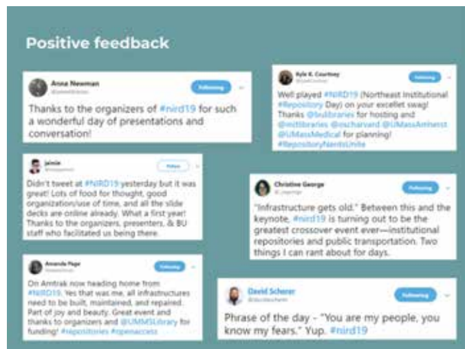
Figure 2. A sample of #NIRD19 Twitter activity

In order to ensure that we could make the first NIRD free while remaining within our budget, we capped the event at 100 attendees. One hundred attendees from 57 distinct institutions and organizations registered. We estimate that we had a total of roughly 97 attendees on the day of the event, counting no-shows and local walk-ins. Twitter activity during the day for the event’s hashtag, #NIRD19, was positive and encouraging (Figure 2).