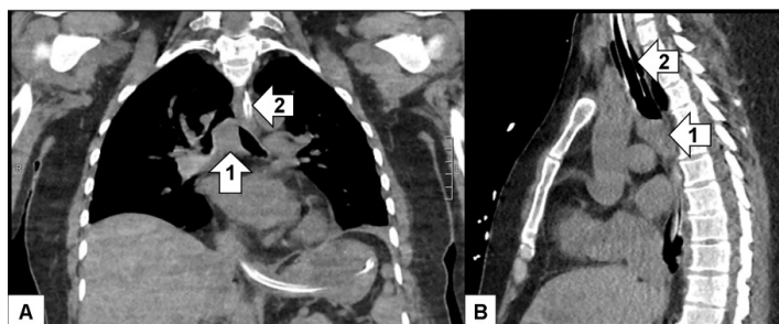
Image 2. Coronal (A) and sagittal (B) computed tomography of the chest without contrast of a 40-year-old female with dyspnea showing a mass at the carina (1). (Trachea with endotracheal tube [2] is marked to orient the reader.)

Initial management in the ED most importantly included management of the patient's airway. A smaller-bore endotracheal tube than is typically used in the ED should be selected to prevent a forceful, traumatic airway or inability to pass the endotracheal tube. Steroids do not play a beneficial role in airway obstruction in the setting of tracheal tumors and