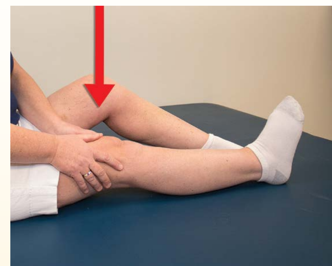
Two knee exercises: straight leg raise and knee extensions