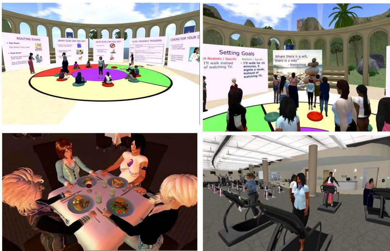
Figure 2. Pictures of the Virtual World participants engaged in various intervention sessions.

Figure 2 contains pictures of virtual world intervention sessions and edited clips of the sessions (see also Multimedia Appendix 1).