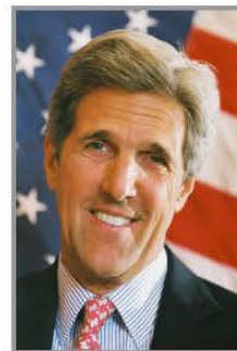
U.S. Sen. John Kerry

"As the only public medical school in the state, the University of Massachusetts Medical School continues to make its mark by conducting breakthrough basic research that can be transformed into treatments and cures for patients. I am pleased that UMass has been recognized for its outstanding work. This funding will help the school move forward with research that leads to important scientific discoveries and new clinical practices."