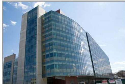
The Ambulatory Care Center (ACC), a seven-story, 258,000-square-foot facility scheduled to open this summer, will house the Clinical Facility for Innovative Research and Education.

UMass Medical School and UMass Memorial Medical Center have created the Clinical Facility for Innovative Research and Education (CFIRE), a center that will combine the basic science innovation that has made the Medical School a biomedical powerhouse with the Medical Center's research potential. CFIRE will be located in the $120 million Ambulatory Care Center (ACC), a seven-story, 258,000-square-foot facility that is scheduled to open this summer. The center will be linked to a number of clinical programs in the building, including the hospital's Centers of Excellence—Heart and Vascular, Diabetes and Endocrinology, Musculoskeletal and Cancer—providing closer collaboration between clinicians and researchers.