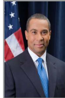
Governor Deval Patrick

"The University of Massachusetts Medical School has shown once again that it leads the pack nationally, and this grant will help turn their cutting edge research into treatments and cures that will improve the lives of countless Americans. I'm proud that the discoveries of tomorrow will start right here in Massachusetts."