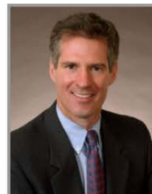
U.S. Sen. Scott Brown

"This award reaffirms something that those of us in Central Massachusetts have known for a long time – that UMass Medical School is one of the finest institutions in the country. I want to congratulate them for this remarkable achievement."