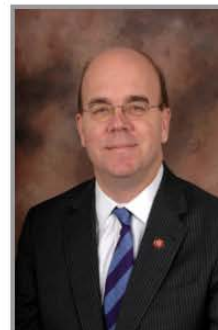
U.S. Rep. Jim McGovern

"As a recipient of this generous award, UMass Medical School continues to prove it is one of the nation's leading research institutions. I sincerely appreciate the support from the National Institutes of Health and congratulate the talented people at UMass Medical School whose hard work and dedication to science resulted in this investment."