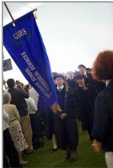
The Graduate School of Biomedical Sciences graduated its first master's in clinical investigations class this year.

Initiated three years ago as part of the UMass Medical School's effort to translate research breakthroughs in the laboratory to viable treatments for patients in the clinic, the Master of Science in Clinical Investigation (MSCI) program, offered by the Graduate School of Biomedical Sciences, graduated its inaugural class at the 37th Commencement exercises this year.