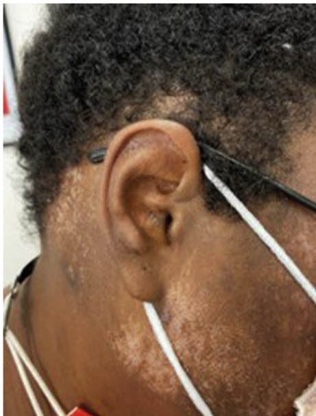
Fig 2. Depigmentation and repigmentation of the face.

A Microphthalmia transcription factor immunohistochemical stain indicated rare junctional epidermal melanocytes, focally overlying hair follicles, with reduced or absent melanocytes in the interfollicular epidermis (Fig 3). The remaining retained pigment and melanocytes were centered around the follicle and adnexal structures. Additionally, there were dyskeratotic keratinocytes in the epidermis (Fig 4).