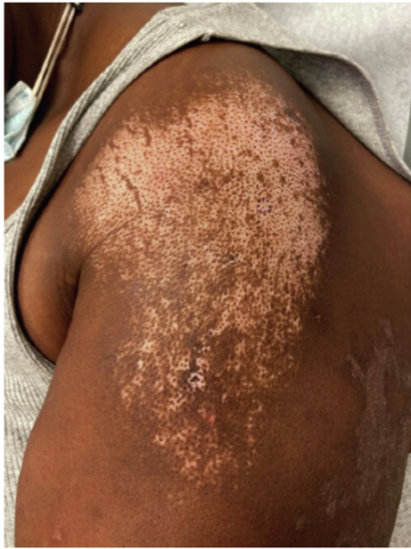
Fig 1. Depigmentation and repigmentation of the left arm at the site of vaccine administration.