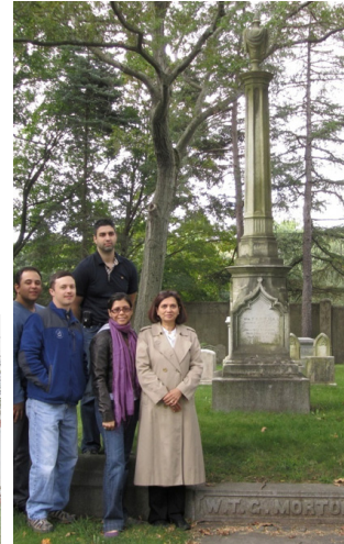
WTG Morton's Grave, Mt. Auburn Cemetery, Cambridge, MA