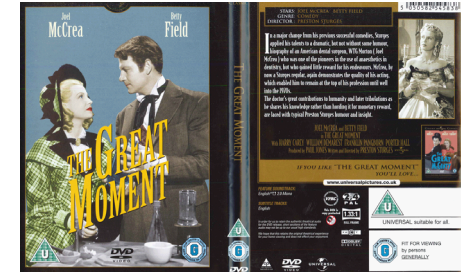
The Great Moment, a 1944 Hollywood movie