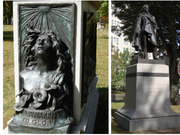
Horace Wells' Grave (l), Cedar Hill Cemetery, and Statue (r), Bushnell Park, Hartford, CT