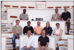
Ether Dome at Massachusetts General Hospital, Boston