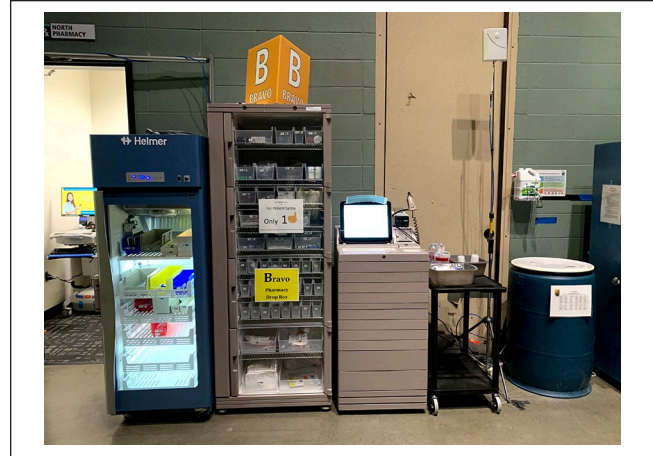
Figure 2. Bravo ADC.

The COVID-19 pandemic has required pharmacists to step out of their traditional roles and provide patient-centered