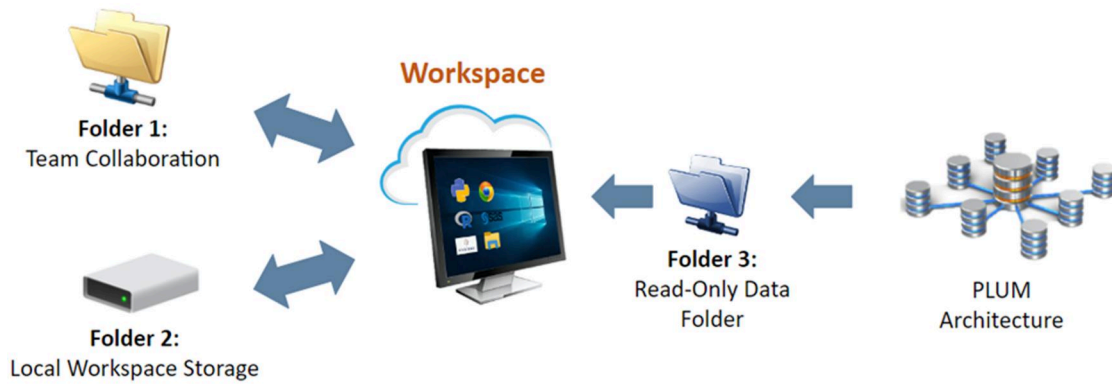
Figure 1. The folder management system for virtual workspaces consists of 3 folders: (1) A folder for team collaboration, (2) A local storage folder for each user, and (3) a folder for the RIC to share data from our research data repository in PLUM.

information. Once the system was configured, we defined roles and access levels and only granted access to shared folders to authorized individuals. This ensured that only those who were permitted could access the data.