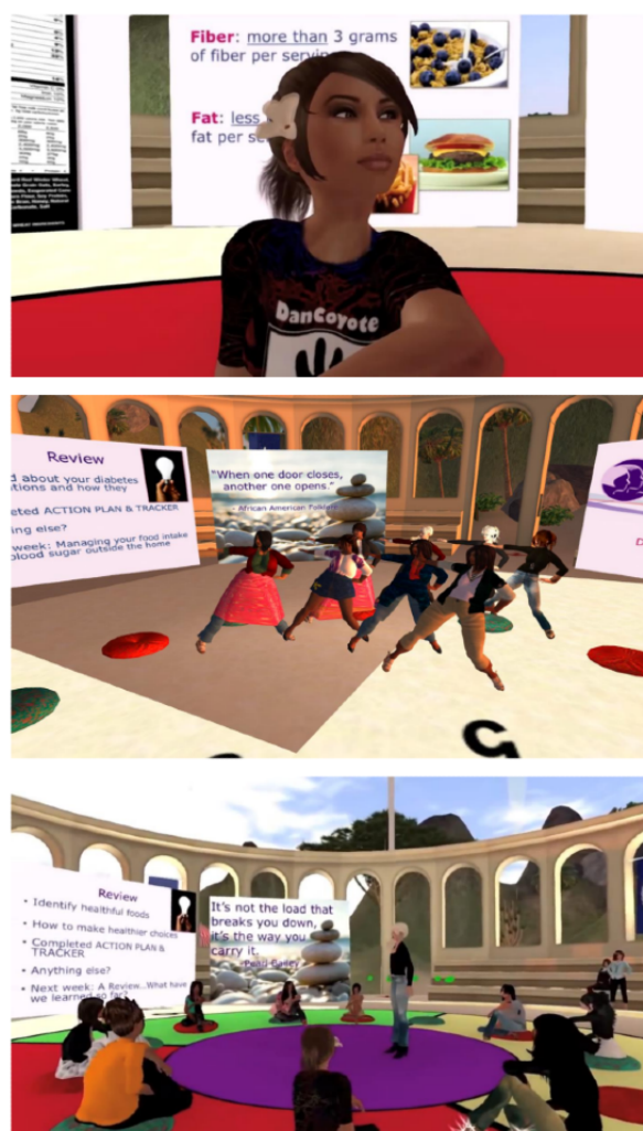
Figure 1. Illustration of avatars in the virtual world.

Following the 8-week DMGV sessions, participants entered a 16-week maintenance period. They were encouraged to self-monitor (tracking blood glucose, blood pressure, diet, and exercise) using a paper booklet or mobile app. No formal DMGVs occurred.